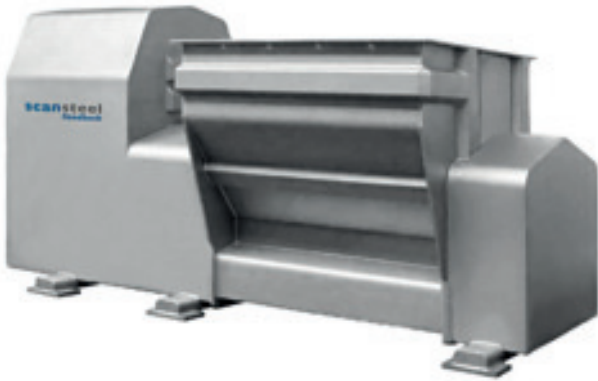
scansteel foodtech Whole Pallet Crusher – Twin (shown without sub frame)

scansteel foodtech whole pallet crusher series is another machine belonging to the family of work horses within our heavy duty applications for, typically, the pet food, rendering and mink feed lines. When it comes to crushing whole pallets of frozen blocks (which are frozen together) of animal by-products. The scansteel foodtech whole pallet crusher is constructed in stainless steel (AISI 304) and is also used within the food processing industries.