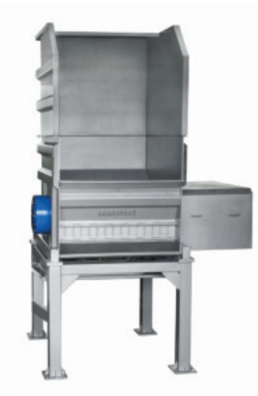
scansteel foodtech Whole Pallet Crusher – Single (shown with sub frame)

Both crushers have a tight claw design (knife configuration) which ensures the output of the meat raw material particle size has quite small particles. (see below).