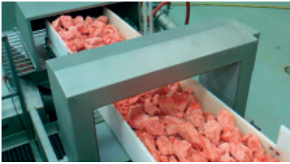
Picture showing meat raw material being discharged from the scansteel foodtech single- and twin crusher.